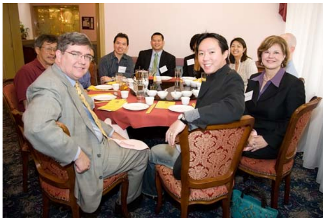
AABA members and judges enjoying dim sum