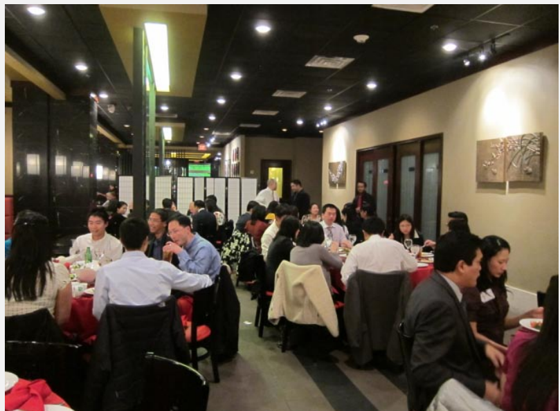
The crowd at Yao's