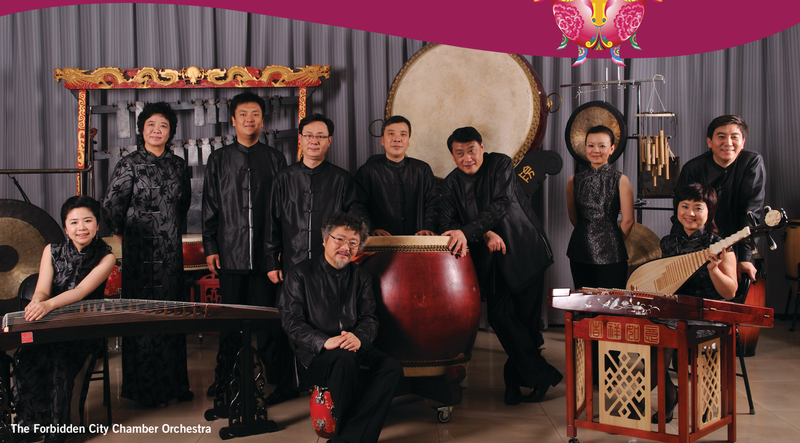
The Forbidden City Chamber Orchestra

Saturday, January 31, 2015, 2:30 pm Chinese Community Center 9800 Town Park Drive, Houston, TX