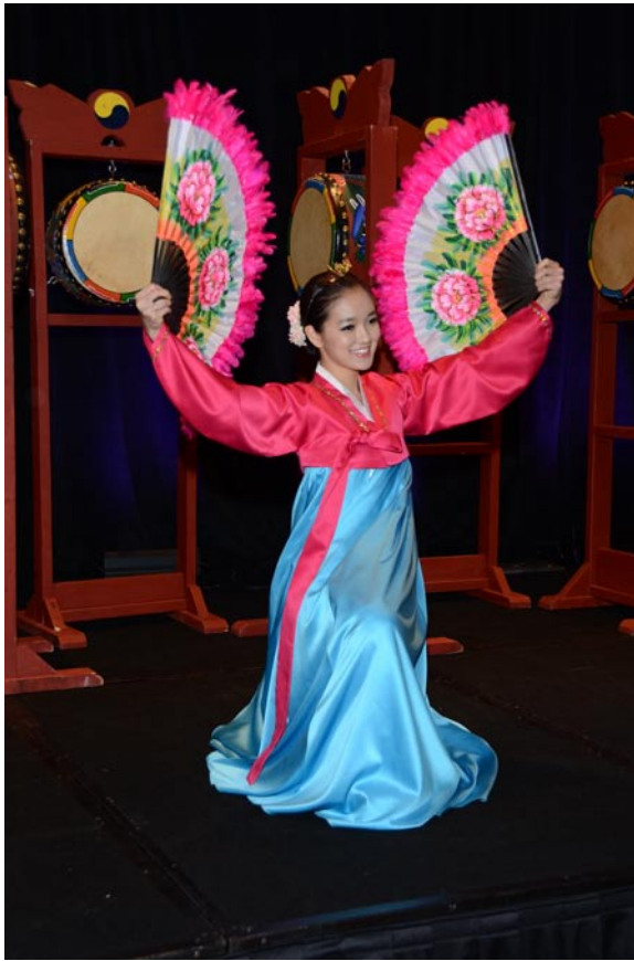
Dancer from Arirang Dance Group