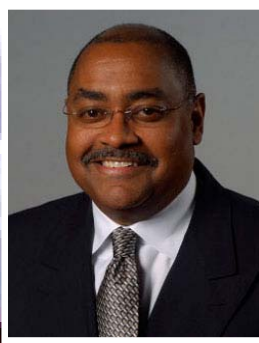
State Senator Rodney Ellis