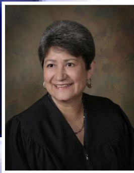
Honorable Judge Josefina Rendon