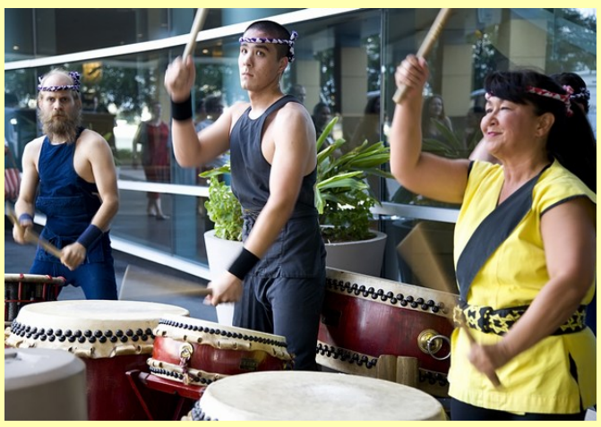
Kaminari Taiko welcomes AABA guests