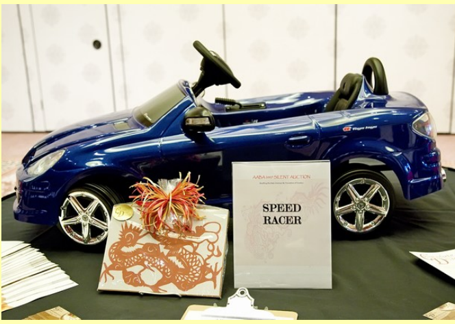
Mercedes-Benz Replica Pedal Car, up for Silent Auction