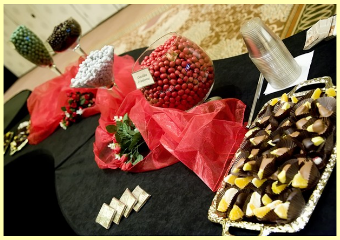
Gala Reception Decadent Chocolate Buffet, courtesy of Chocolate Designs