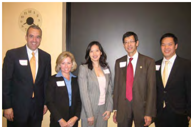
Our distinguished panel of speakers