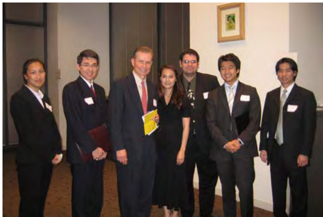
Current and future IP lawyers

After the panel discussion, the audience separated for breakout sessions entitled "Perspectives from the Trenches," where law students were given opportunities to speak one-on-one with current practicing attorneys about different areas of the law, such as litigation, corporate, IP, employment, immigration, government, and public interest law. The newly published 2007 AABA Resume Books were also distributed to all attorney and law firm attendees.