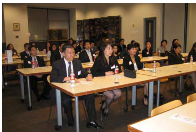
Students closely attend the panel discussion