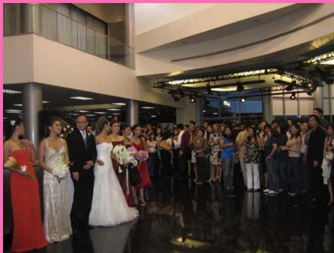
The crowd surveys the Misora Bridal fashion show