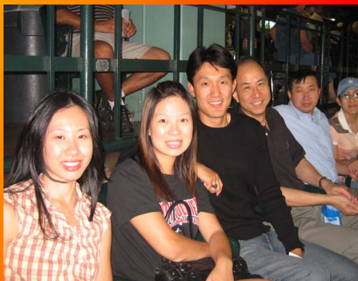
AABA members and guests enjoying the game