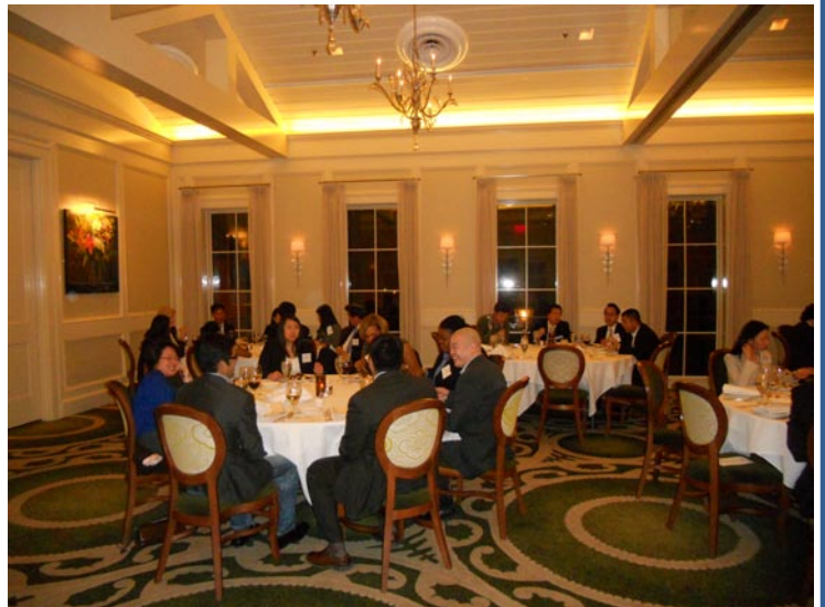
The attendees at Brennan's of Houston