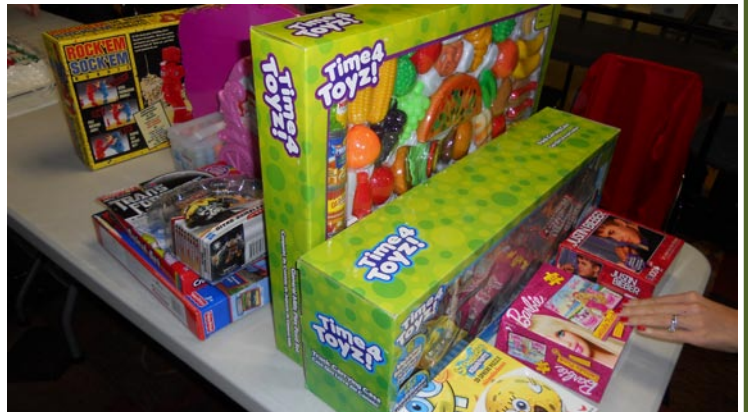
Donated toys for Asian American Family Services