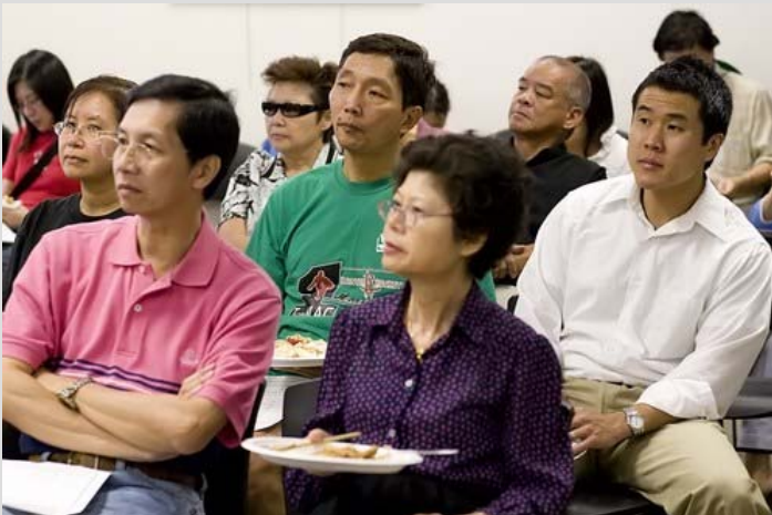
Mandarin Chinese-speaking attendees