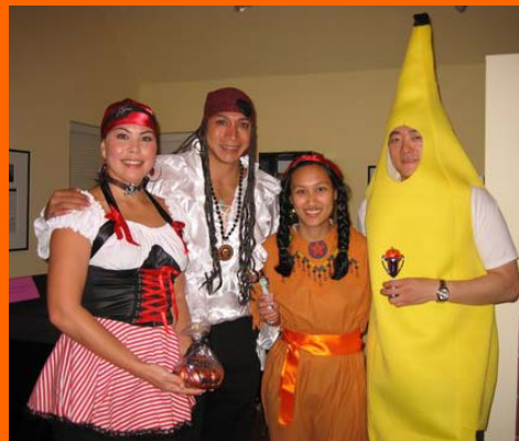
Costume Contest Winners!