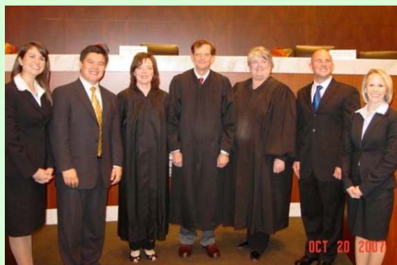
Final round teams and judges