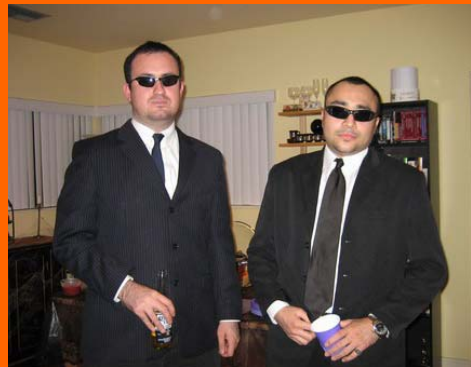
The Men in Black kick back